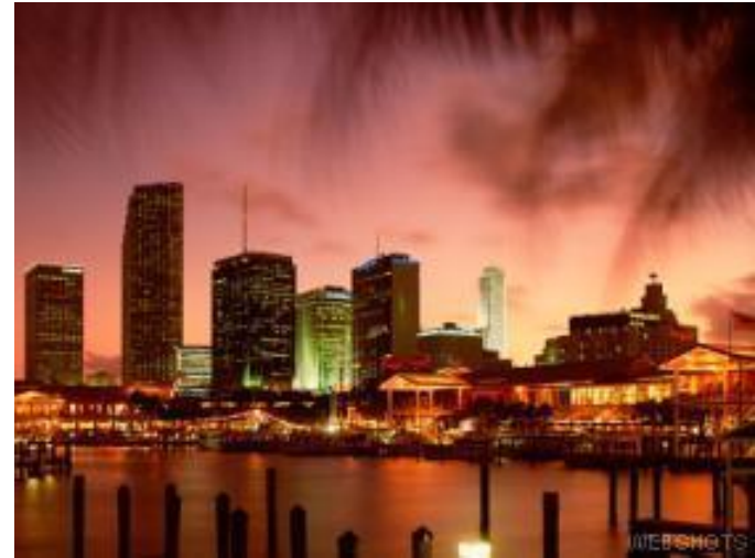
LanguageSpeak Headquarters: Miami, FL